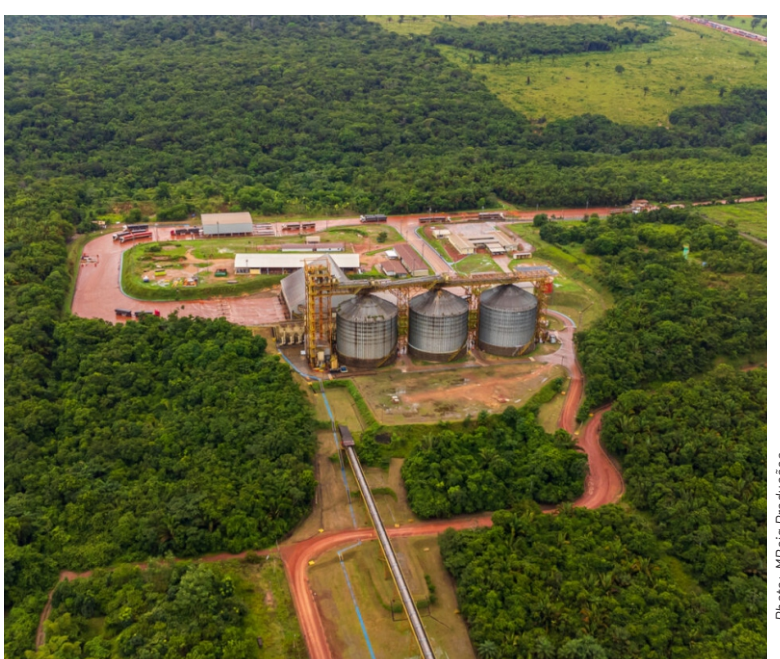
Port of the US transnational company Cargill in the district of Miritituba, Itaituba.