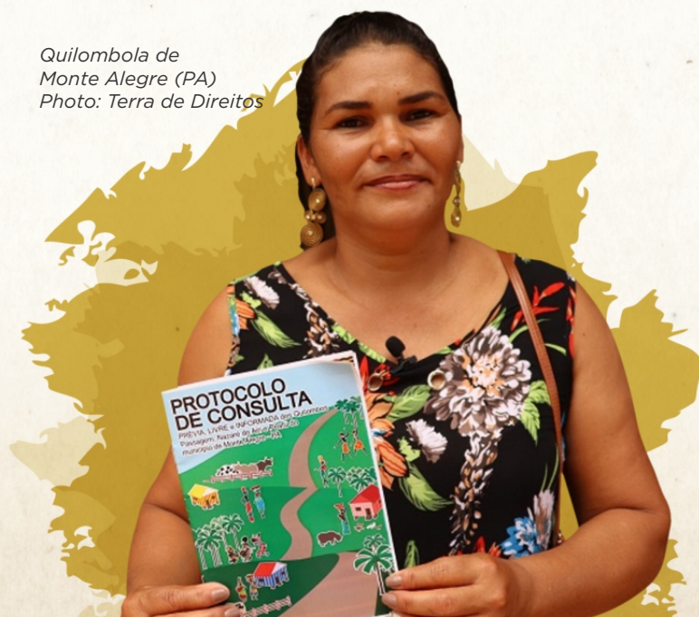
Quilombola de Monte Alegre (PA)

The number of titles issued during Bolsonaro's government was not even lower only because all the communities that had their territories partially titled took legal action due to the slowness of the Brazilian State in titling traditional territories. That is what happened with the Paio de Telha community (state of Paraná/PR).